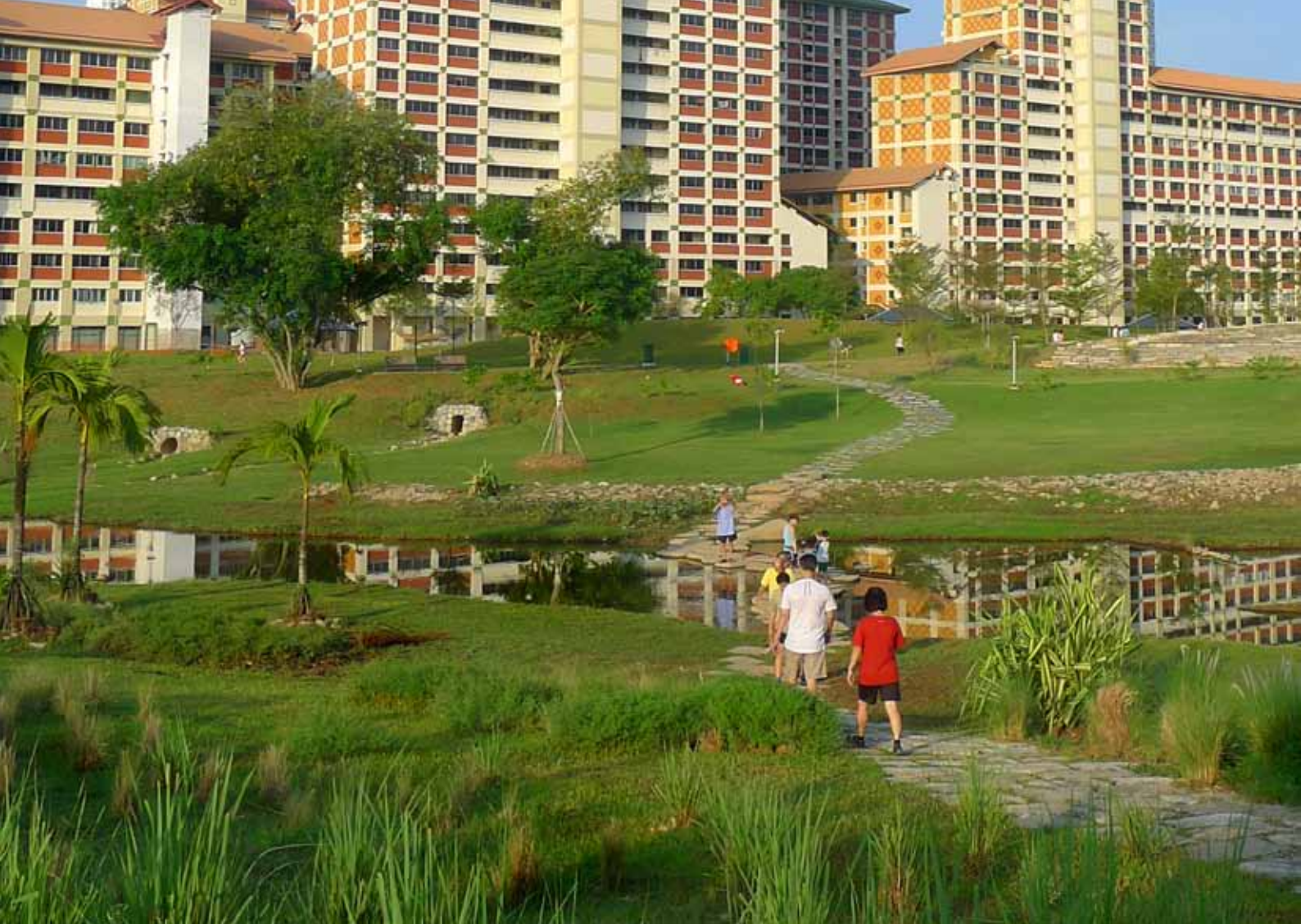
New informal river crossings and bridges connect neighbourhoods which have been separated for years by the old concrete channel.