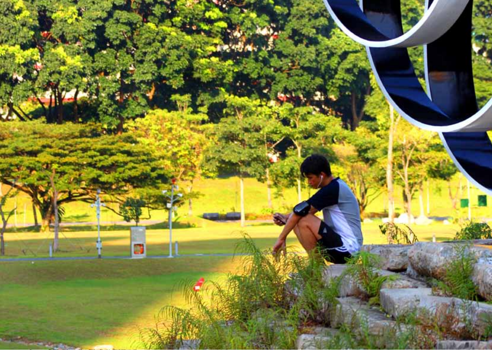
“Recycle hill” is a look-out point built from the recycled concrete channel.