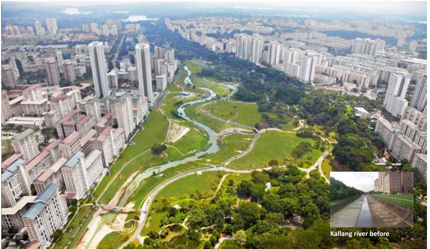
Kallang river before